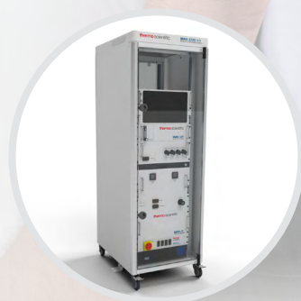
EMS-10 Continuous Emissions Monitoring System