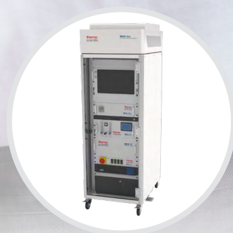
MAX-Bev CO 2 Purity Monitoring System