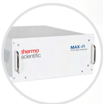
MAX-iR FTIR Gas Analyzer

Sign up to stay up-to-date on new products, application solutions, and upcoming events at thermofisher.com/maxoptin .