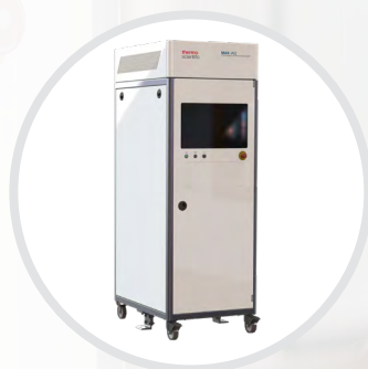
MAX-iAQ FTIR Ambient Air Monitoring System